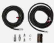
Front-End Loader Hose Kit 20': PN 256104 25': PN 196056