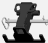
Intimidator & Intimidator XL 2" Hitch Receiver Kit PN 260050