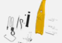
Intimidator XL Grapple Kit PN 240304