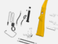
Intimidator Grapple Kit PN 250204