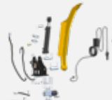
Intimidator CT Grapple Kit PN 240509